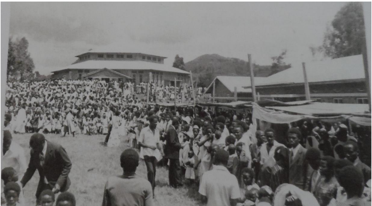
Festivities in preparation of 40 marriages