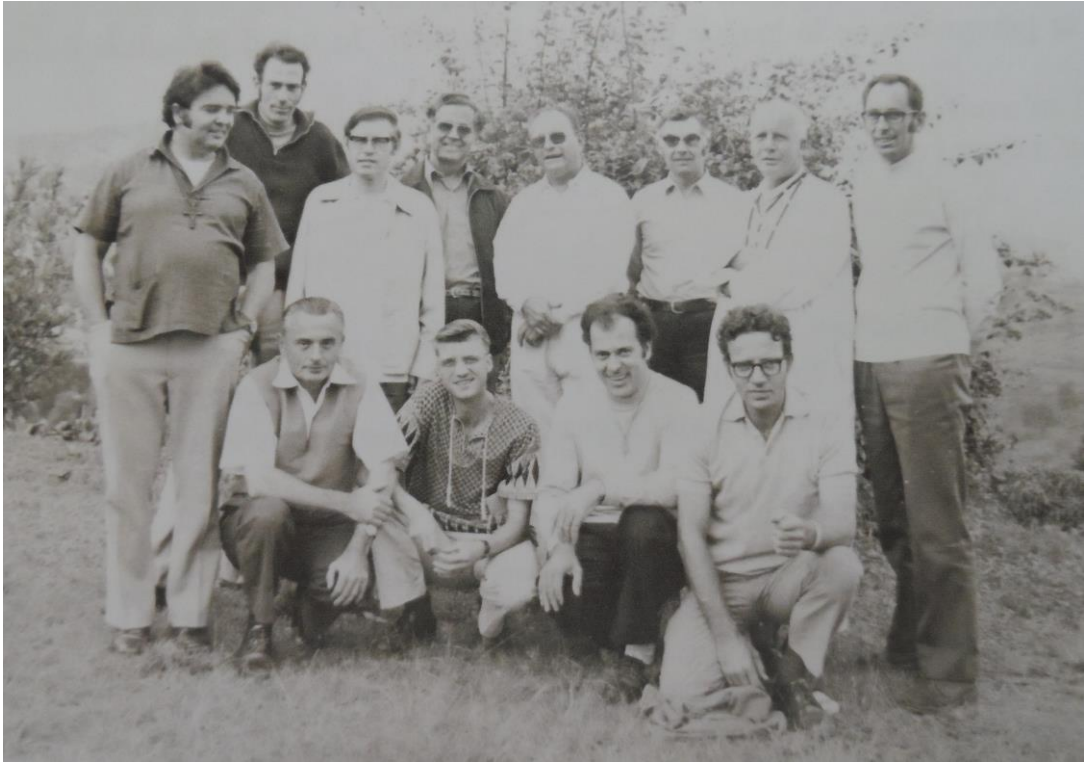
White Fathers of Kabale Diocese