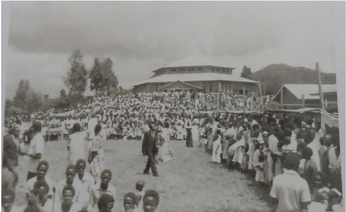
“The Church is too small!”