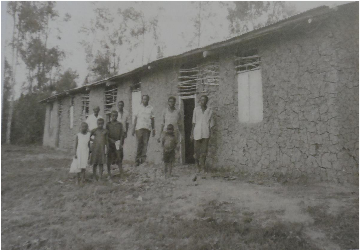
School, Kirwanba, Nyarushanga